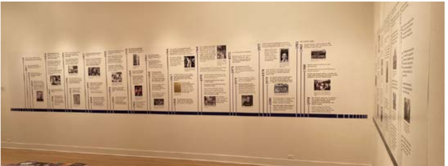
Last fall, the Harnett Museum displayed a timeline of historical LGBTQ events. The Print Shop created a series of large panels on vinyl adhesive. It took two days to complete and used 498 inches of material.