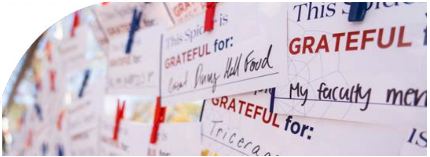
ABOVE: Cards printed for Giving Day.